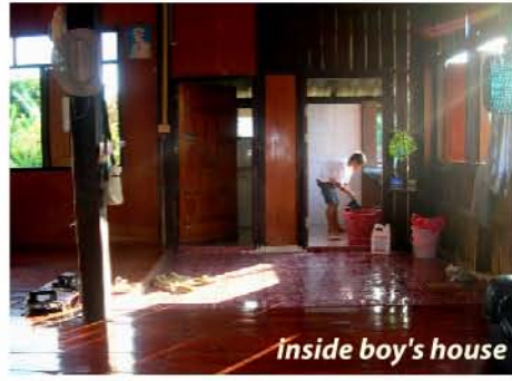
inside boy's house